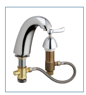
405 Series cold water only