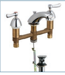
404 Series with pop-up