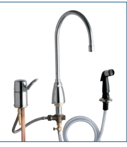
2304 Series with side spray