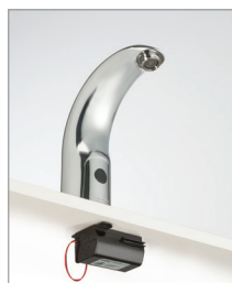
LTPS is easily mounted under counter.

LTPS End-of-Life Directives (Recycling): LTPS contains materials that are required to be recycled by specialized companies. Please ensure you dispose of your LTPS according to local regulations. Follow applicable laws and regulations for transport, shipping, and disposal of batteries. For details on recycling lithium-based batteries, and to find a recycling facility near you, please contact a government recycling agency, your waste-disposal service, or visit reputable on-line recycling sources such as www.call2recycle.org .