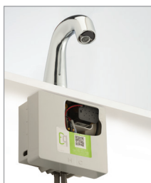
LTPS is integrated into the control box.