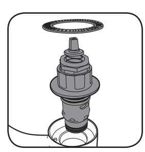
3. Remove cartridge assembly.

2. Loosen cartridge assembly using channel